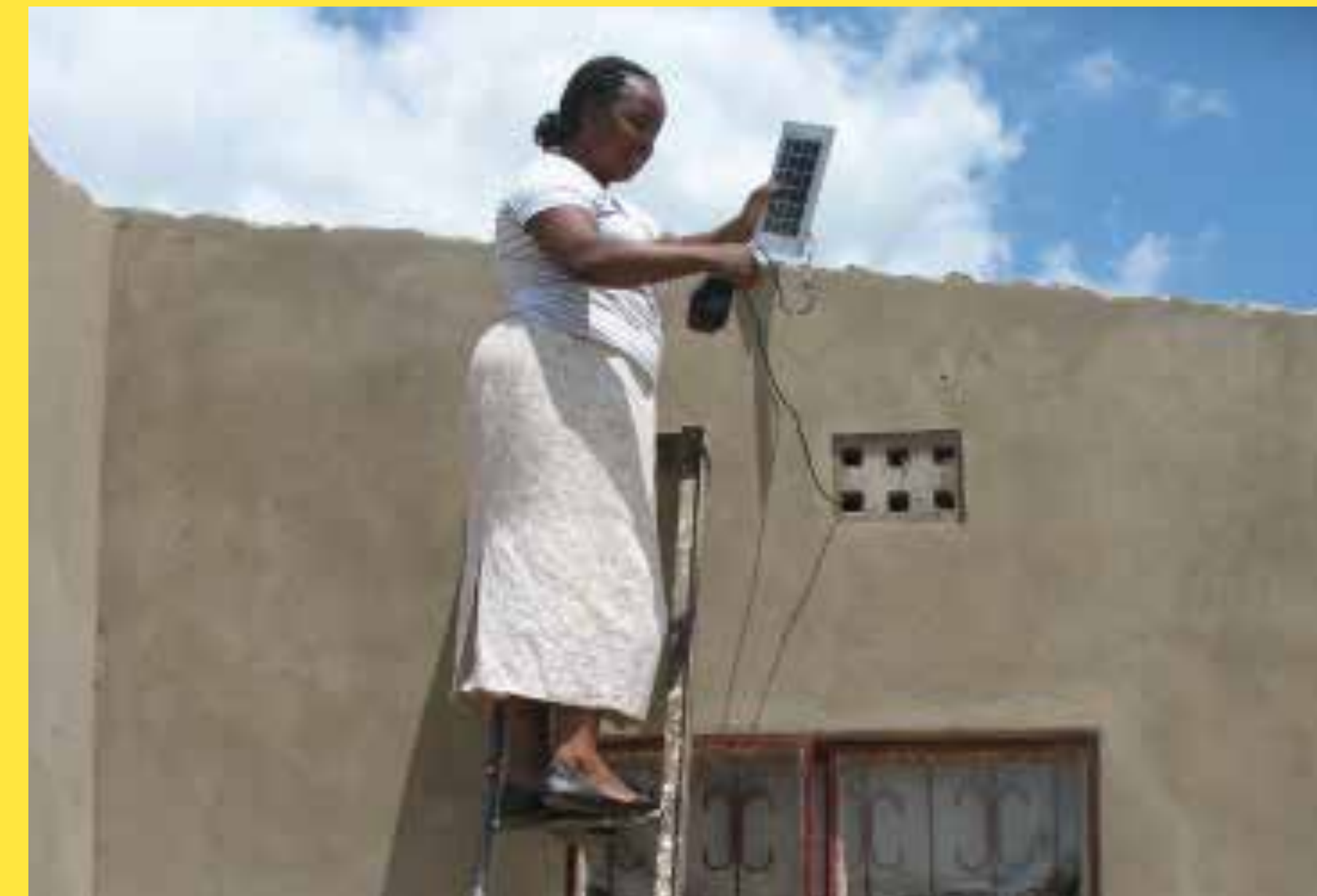
Woman installing a solar lamp in Cameroon