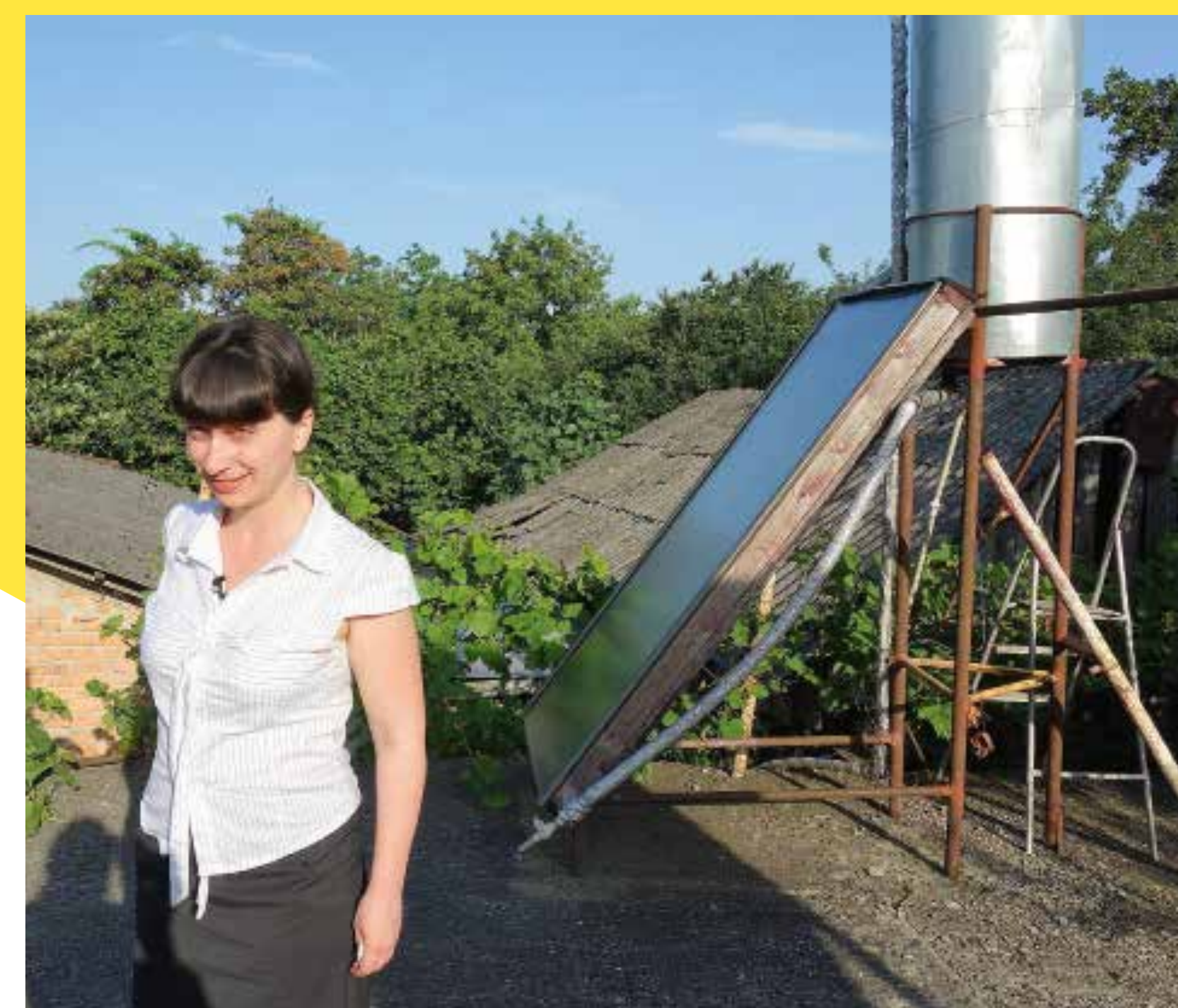
Technology training for women in Georgia